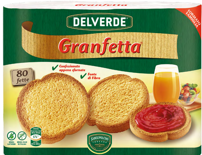
Granfetta 80 rusks 600g | code 460222