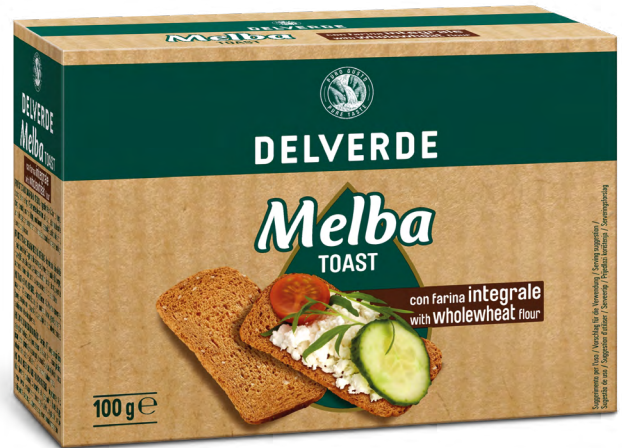
Melba Toast With wholewheat flour 100g | code 085396