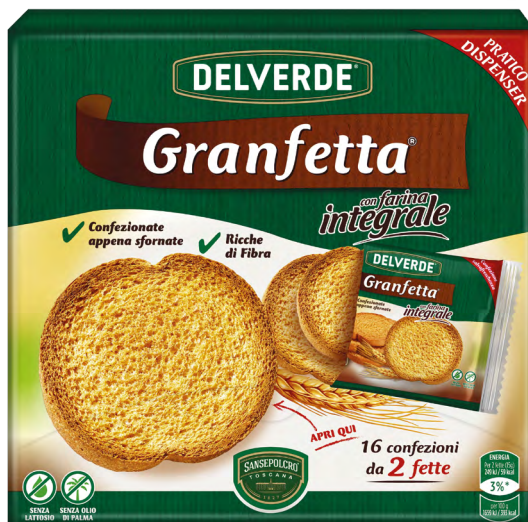
Granfetta with wholewheat flour - single portion 16 portions of 2 rusks 240g | code 460410