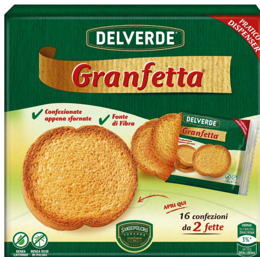
Granfetta - single portion 16 portions of 2 rusks 240g | code 460403