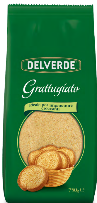
Grattugiato 750g | code 464483