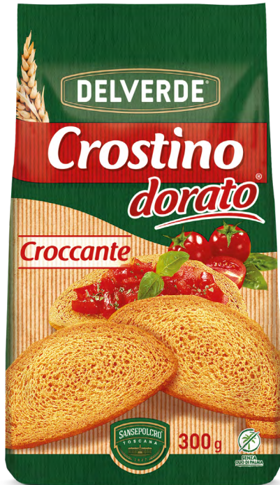
Crostino Dorato Crunchy 300g | code 470101

A simple recipe from the Mediterranean tradition. Crostino Dorato is crispy, light and versatile.