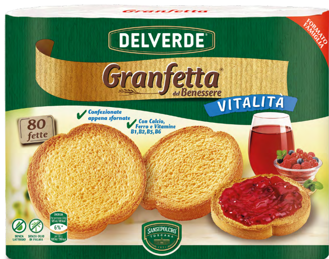
Granfetta Vitalità 80 rusks 600g | code 461954