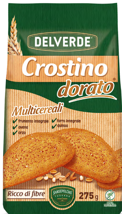
Multicereal Crostino Dorato with Wheat, Oats, Wholegrain Spelt, Barley and Quinoa 275g | code 460098