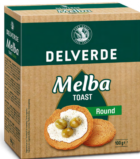
Melba Toast Round 100g | code 085392