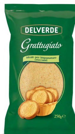
Grattugiato 250g | code 465480