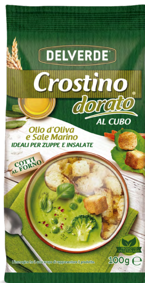
Olive Oil and Sea Salt 100g | code 469490