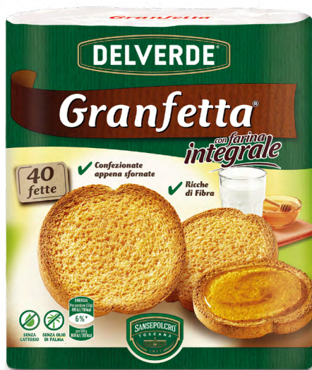
Granfetta with wholewheat flour 40 rusks 300g | code 460223

For consumers that are looking for a great balance between health and taste .