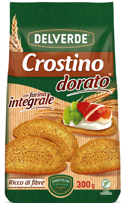
Crostino Dorato with wholewheat flour High in fiber 300g | code 470102