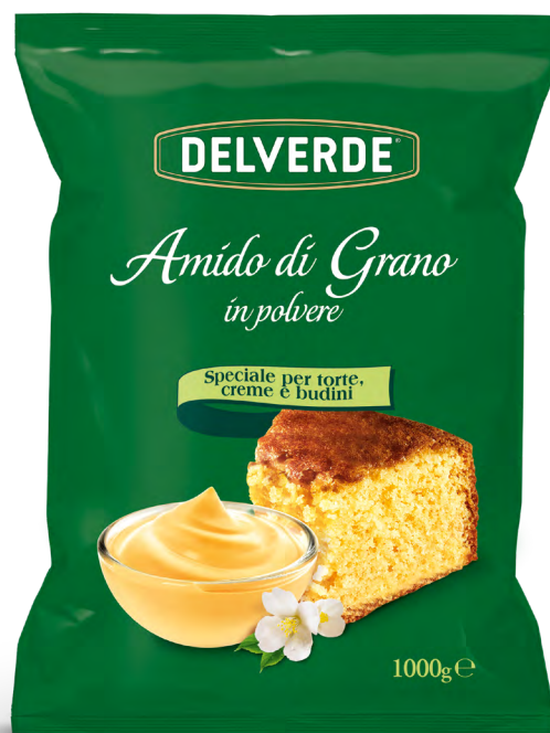
Wheat Starch 1Kg | code 465309