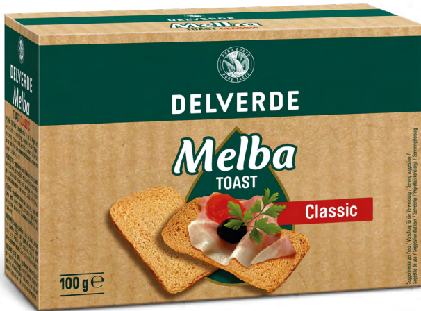
Melba Toast Classic 100g | code 085394

Fragrant and versatile thinly sliced rusk, perfect as a light snack.