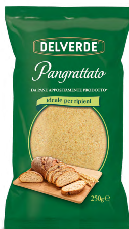
Breadcrumbs 250g | code 466540