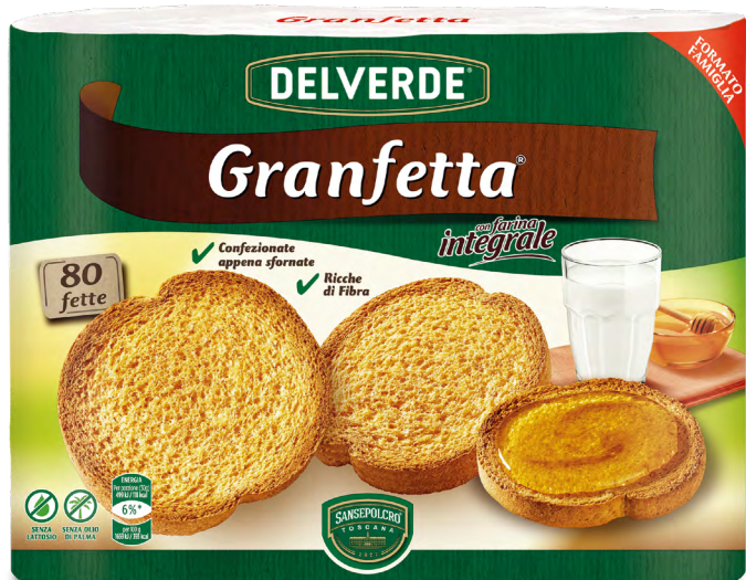
Granfetta with wholewheat flour 80 rusks 600g | code 461798