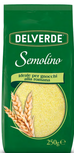
Semolina 250g | code 465251