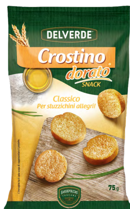
Classico 75g | code 469492

Round snacks of toasted and fried bread extremely crunchy.