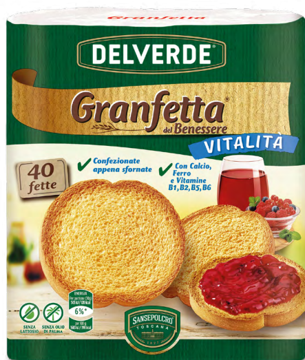
Granfetta Vitalità 40 rusks 300g | code 460224

A daily appointment with wellness, traditionally tasty.