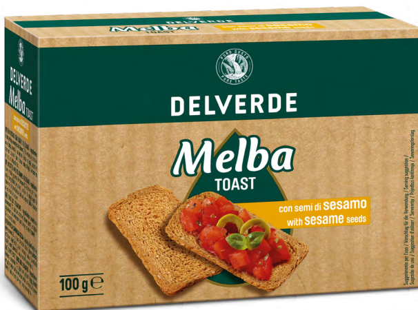
Melba Toast with sesame seeds 100g | code 085395