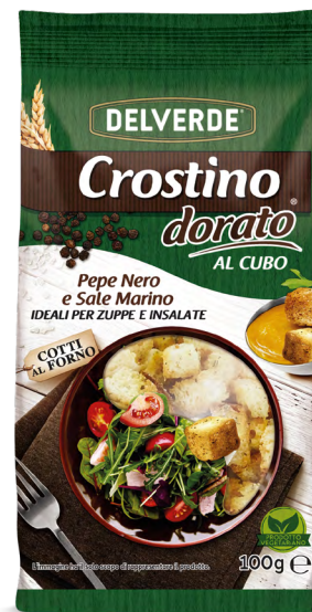
Black Pepper and Sea Salt 100g | code 469491