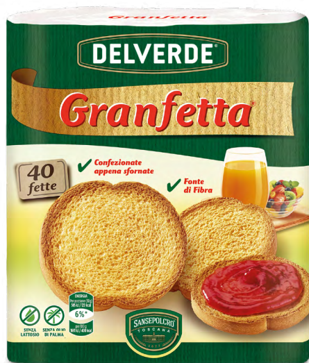
Granfetta 40 rusks 300g | code 460221

It is always time for Granfetta, the traditional round rusk which is perfect for dipping and easy to spread.