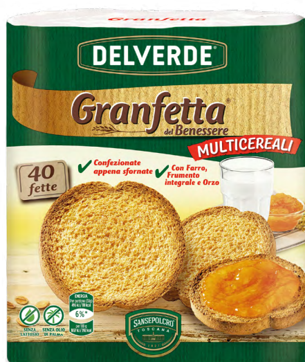
Multicereal Granfetta 40 rusks 300g | code 045452